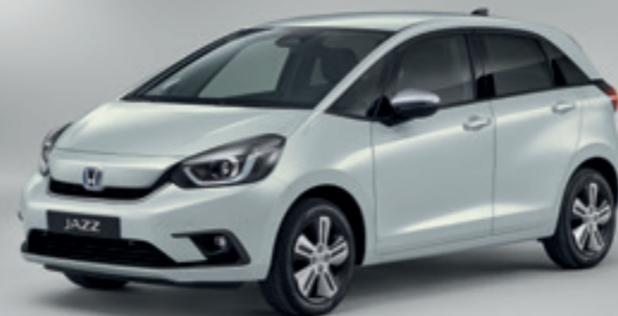
PREMIUM SUNLIGHT WHITE PEARL