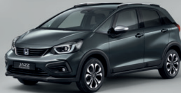
SHINING GRAY METALLIC