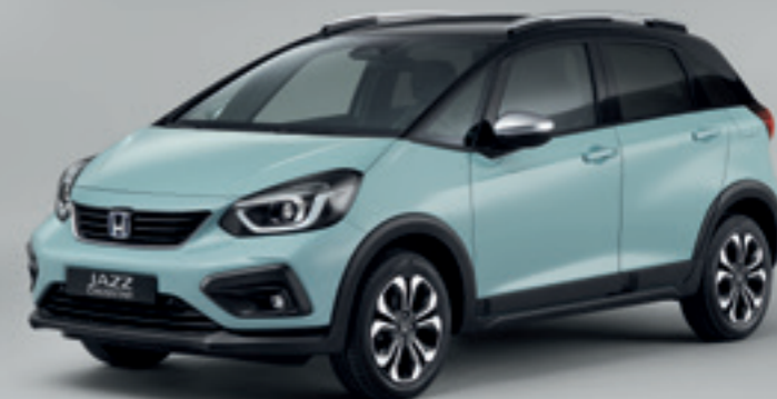
SURF BLUE / TWO-TONE