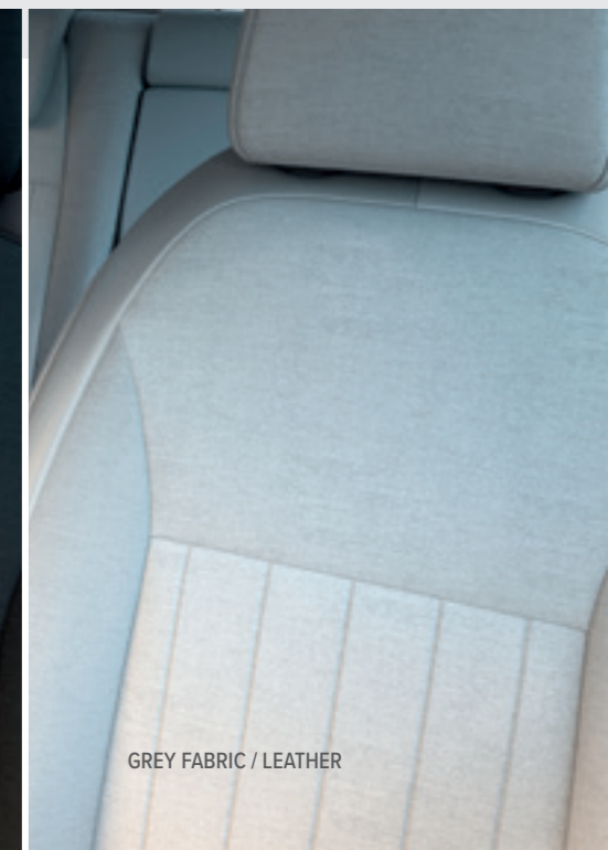
GREY FABRIC / LEATHER