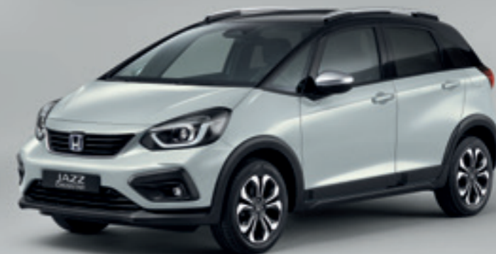
PREMIUM SUNLIGHT WHITE PEARL / TWO-TONE