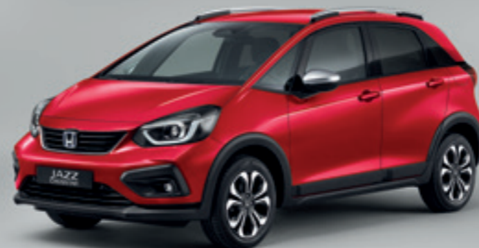
PREMIUM CRYSTAL RED METALLIC