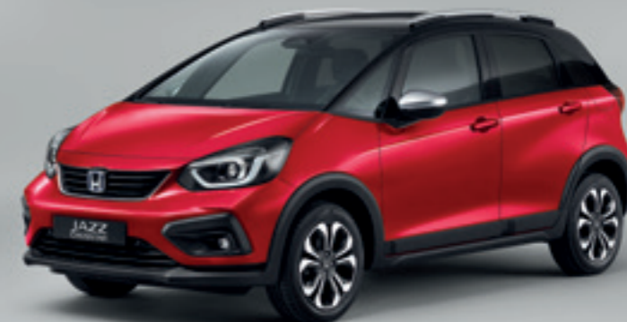
PREMIUM CRYSTAL RED METALLIC / TWO-TONE