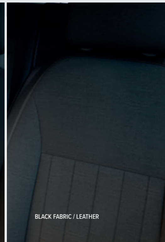
BLACK FABRIC / LEATHER